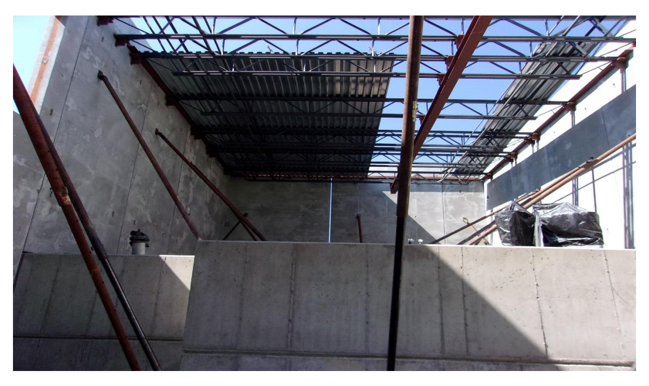
Preparation for placement of finish floor slabs is ongoing.