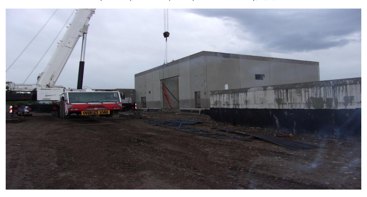
Roof truss and decking installation is ongoing, the temporary braces for the wall panels can't be removed until the truss and deck installation is completed.